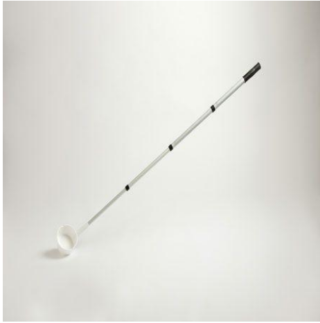
FIGURE 1: PLASTIC DIPPER