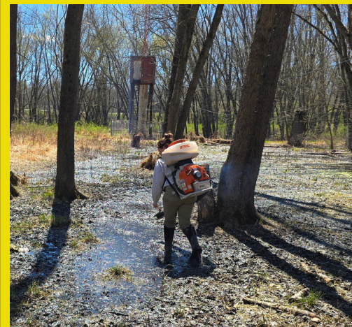
An early season backpack larval treatment

With the early season warm temperatures paired with the county's inundated floodplains, the Mosquito-Borne Disease Control District staff, assisted by DEP staff, started large scale larval treatments in April to avoid an early emergence of mosquitoes. Staff treated approximately 17 acres of larval habitat so far this season.