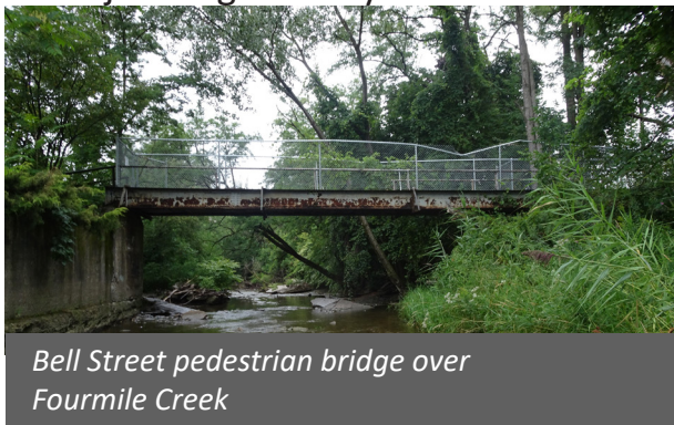
Bell Street pedestrian bridge over Fourmile Creek