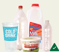
Plastic Bottles, Cups & Containers