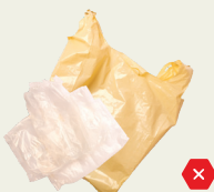
NO Loose Plastic Bags, Bagged Recyclables or Film Empty recyclables directly into your bin