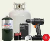
NO Batteries, Power Tools, Flammables or Hazardous Waste