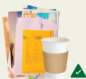
Paper & Paper Cups