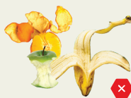
NO Food or Liquids