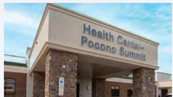
POCONO SUMMIT 174 Harvest Lane Pocono Summit, PA 18346