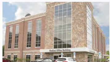
STROUDSBURG 200 St. Luke's Lane, Suite 200 Stroudsburg, PA 18360