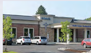
BRODHEADSVILLE 111 Route 715, Suite 104 Brodheadsville, PA 18322