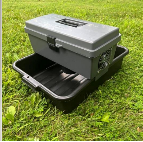
FIGURE 2: GRAVID TRAP