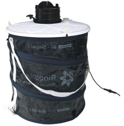
FIGURE 3: BG SENTINAL TRAP