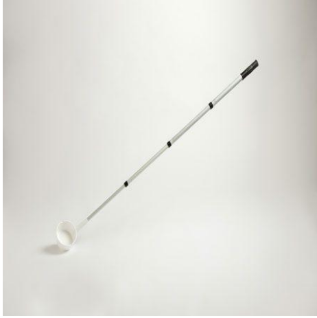
FIGURE 1: PLASTIC DIPPER