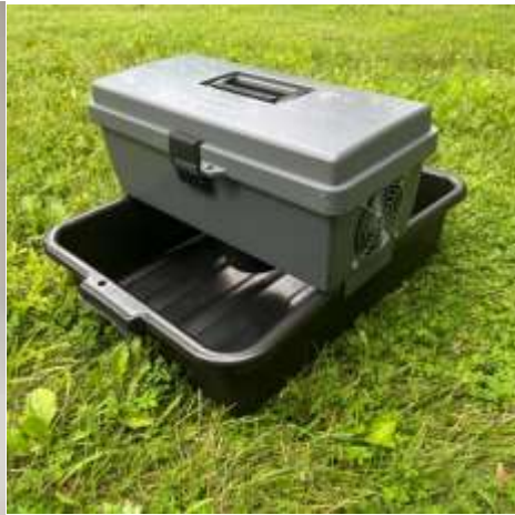
FIGURE 2: GRAVID TRAP