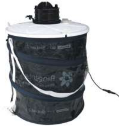
FIGURE 3: BG SENTINAL TRAP