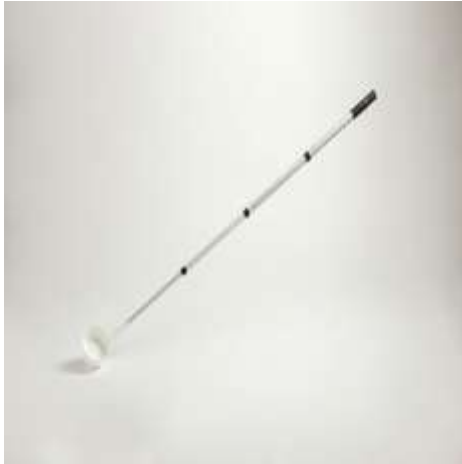
FIGURE 1: PLASTIC DIPPER