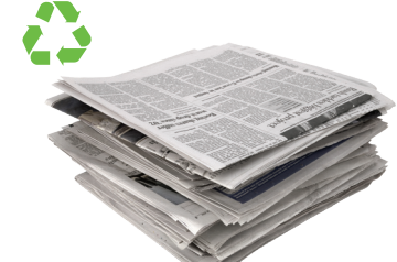
NEWSPAPER Clean & Dry