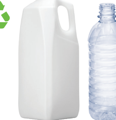
PLASTIC Bottles & Jugs 1, 2 & 5