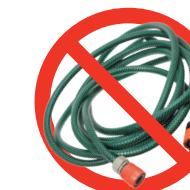
NO Garden Hoses