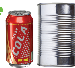
CANS Aluminum & Steel