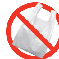
NO Plastic Bags