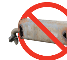
NO Scrap Metal