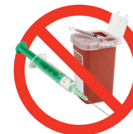
NO Medical Waste