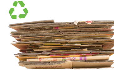
CARDBOARD Dry & Flattened • No Food Contact