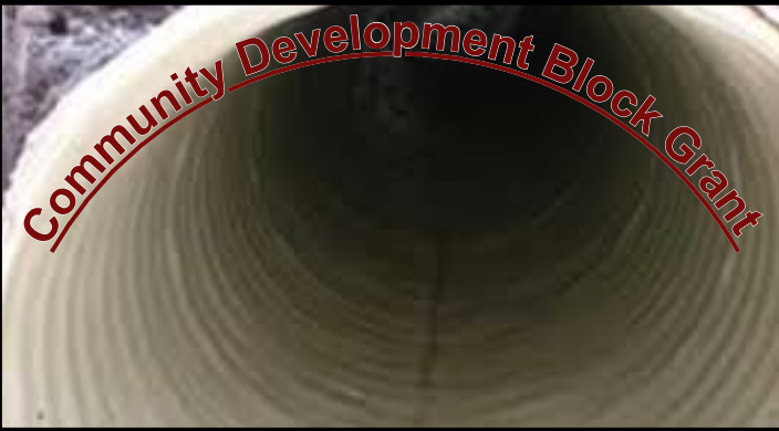
Community Development Block Grant