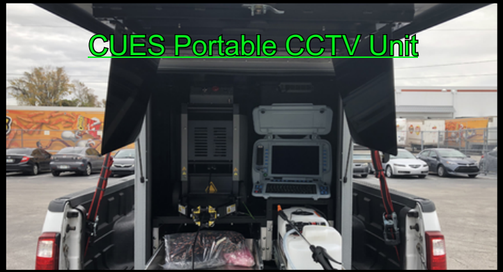
CUES Portable CCTV Unit