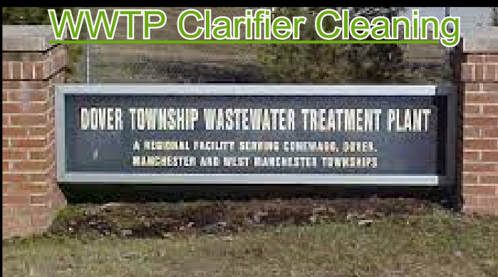
WWTP Clarifier Cleaning