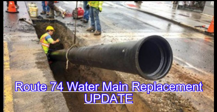
Route 74 Water Main Replacement UPDATE