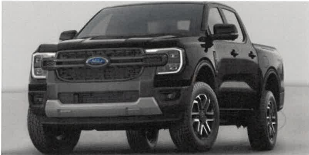
Note:Photo may not represent exact vehicle or selected equipment.

Vehicle: [Fleet] 2025 Ford Ranger (R4P) XL 4WD SuperCrew 5' Box (✔ Complete )